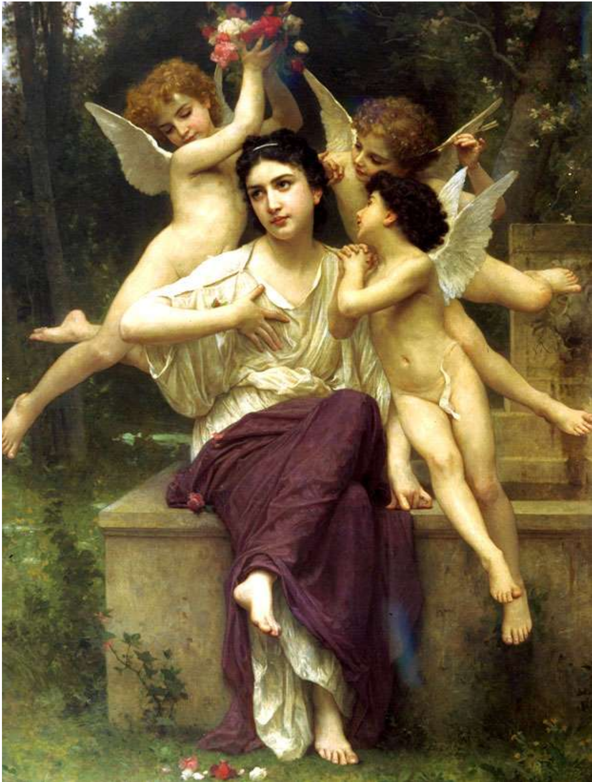
(Artist: William-Adolphe Bouguereau Date: 1825-1905)