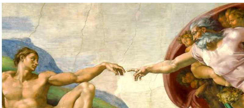
(Artist: Michelangelo Date: 1475-1564)

Behold fire becoming your speech! O mortal! Behold speech entering your mouth! O mortal! Behold air becoming your breath! O mortal! Behold breath entering your nostrils! O mortal! Behold the sun