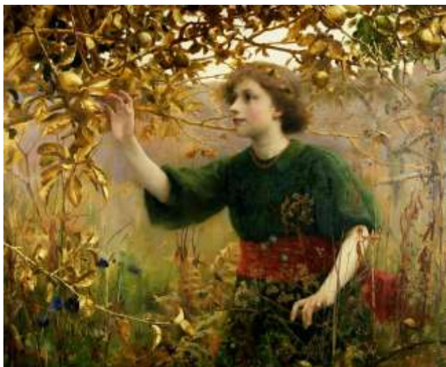
(Artist: Thomas Cooper Gotch Date: 1893)