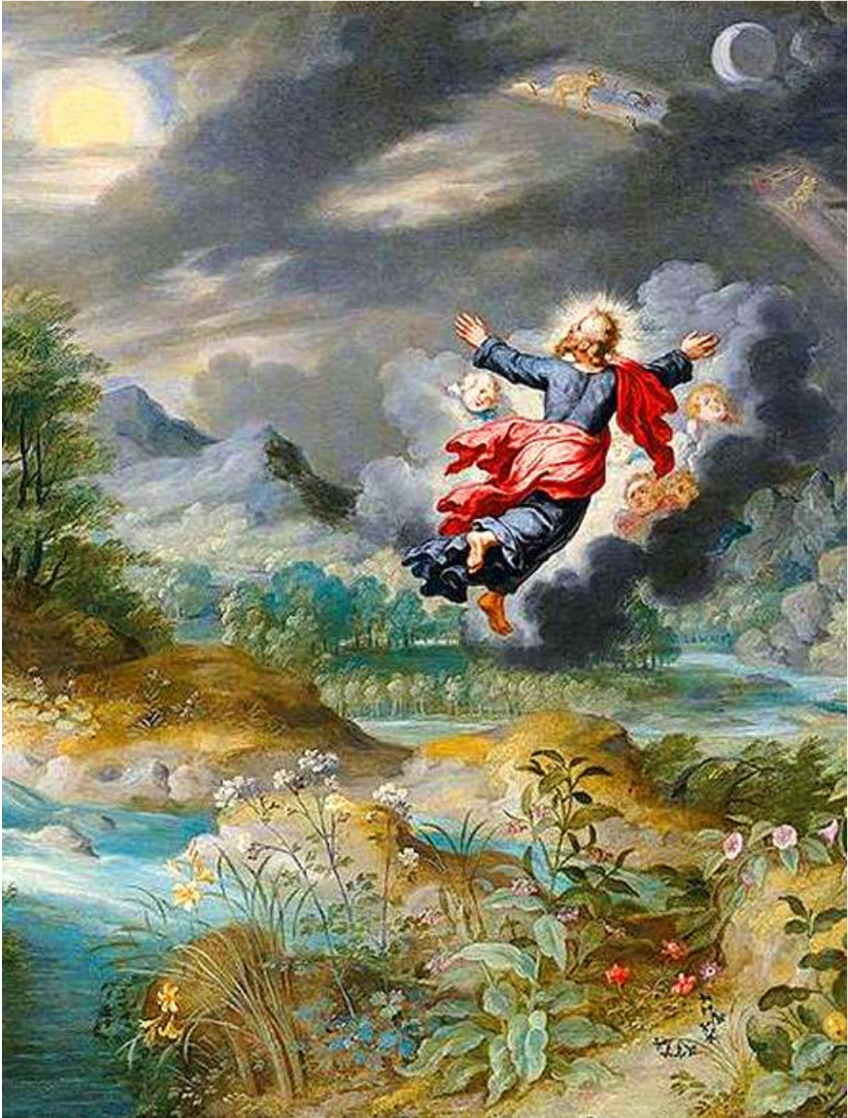
(Artist: Jan Brueghel the Younger Date: 1601-78)