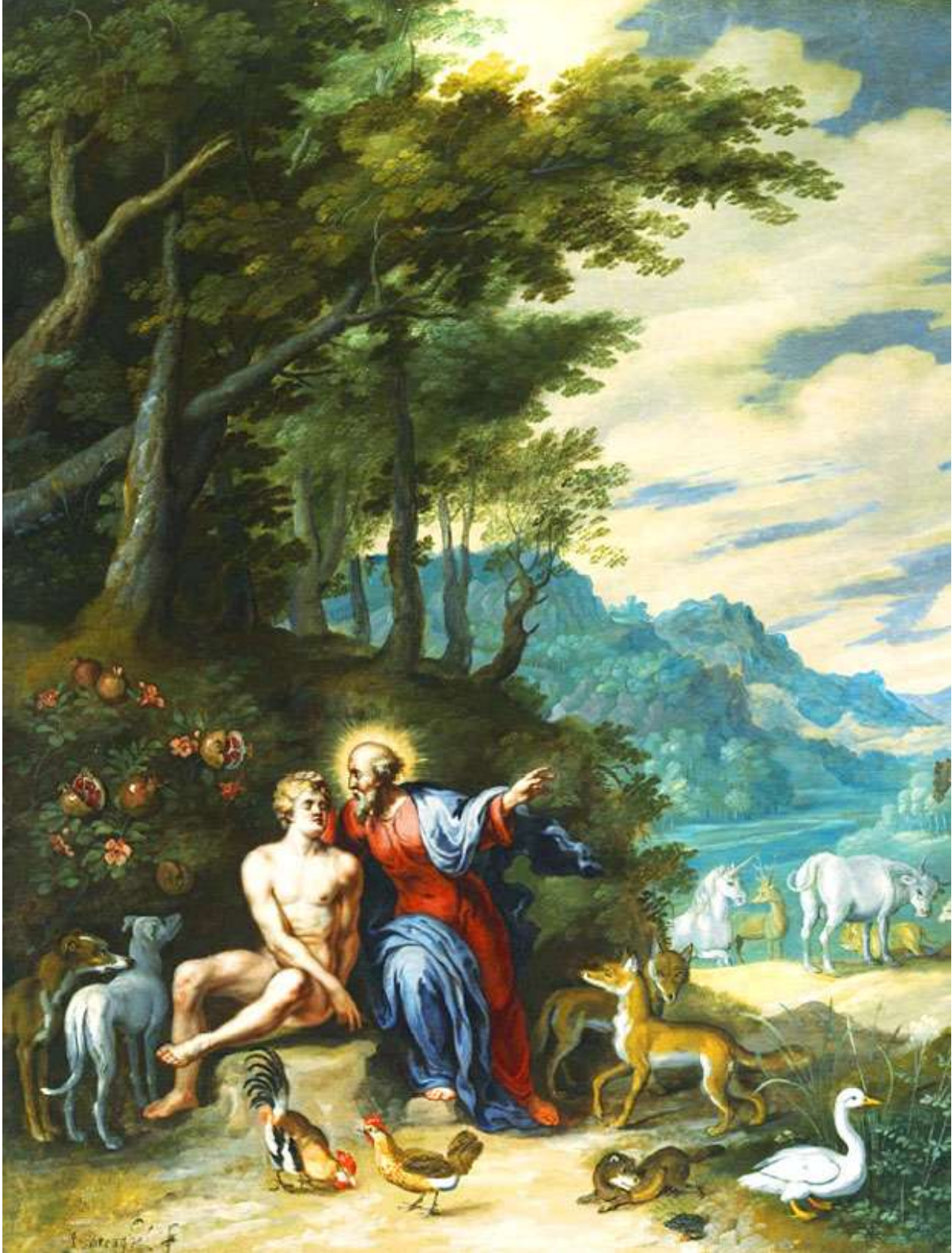
(Artist: Jan Brueghel the Younger Date: 1601-78)